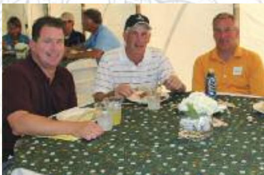
Coborn's hosted its 11 th annual Grocers on the Green golf tournament at the St. Cloud Country Club and Territory Golf Club in St. Cloud to benefit pediatric cancer. Since the tournament's inception in 2002, Grocers on the Green has brought in $1,385,652 to support St. Cloud Hospital Pediatric Cancer Services.