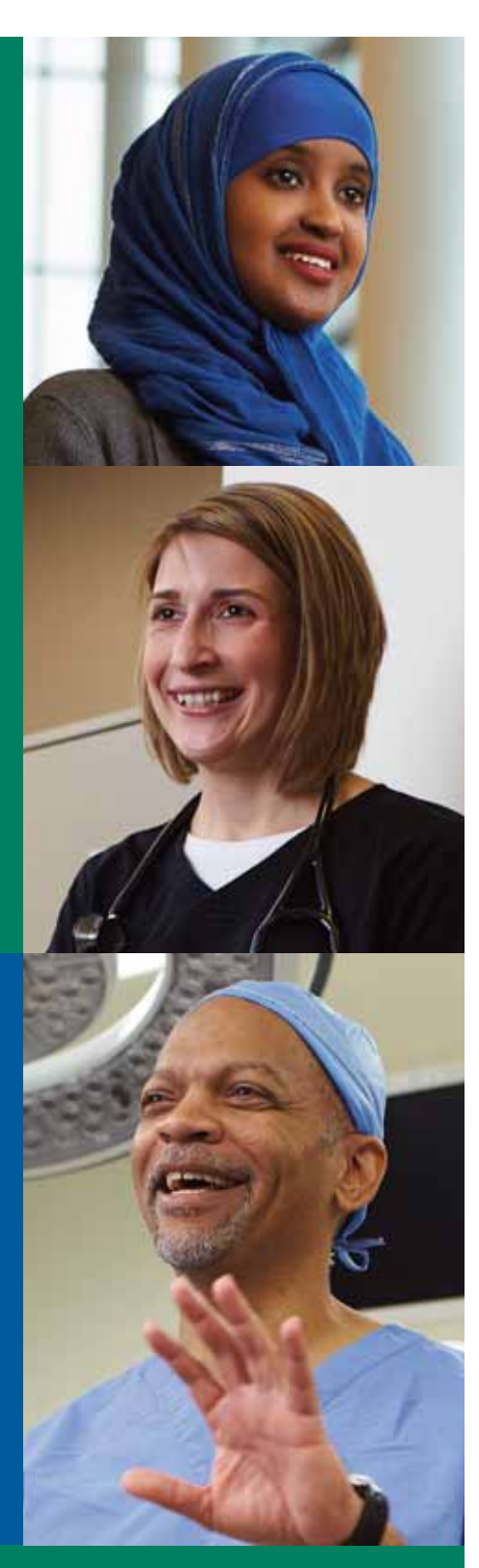
CENTRACARE * St. Cloud Hospital